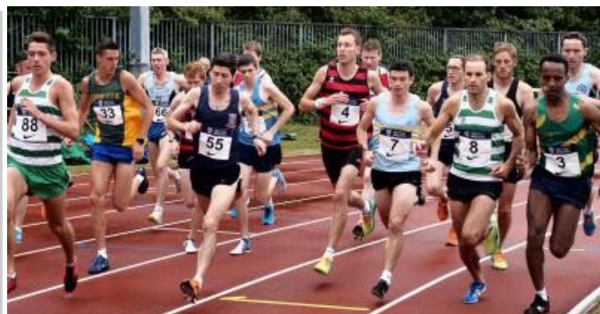
Photo from British League meeting at Tooting, Saturday 5th July

We have every reason to now be optimistic this season with our young team that has proved that the season's target of 3 rd place is achievable.