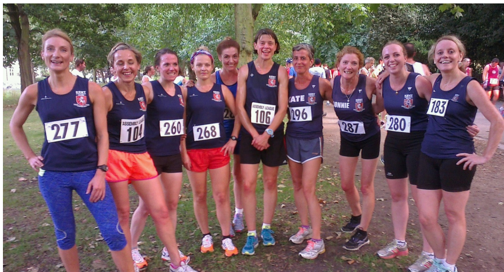
Kent AC Women at an Assembly League meeting in Victoria Park