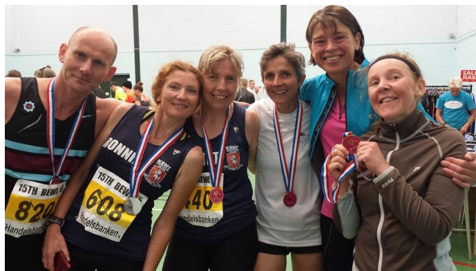
Kent AC Women at the Bowl 15 in July